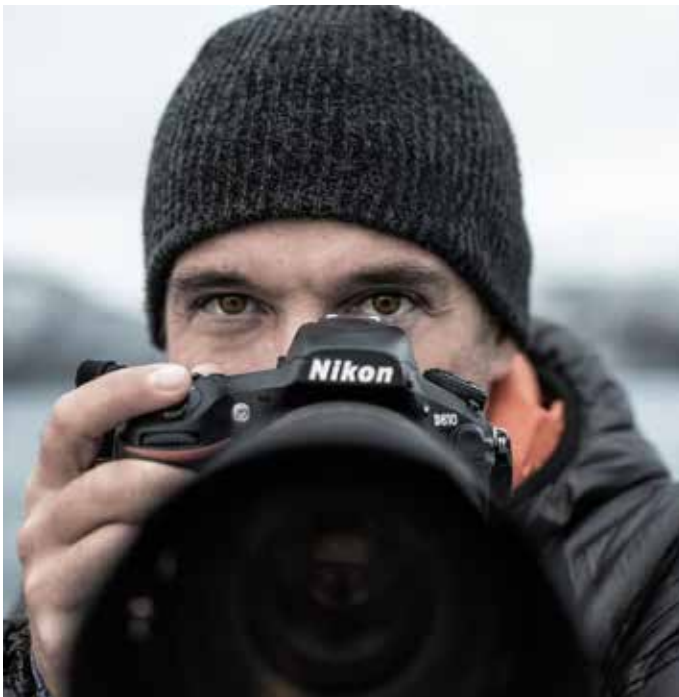
Greg Lecœur - photo Credit : Greg Lecœur